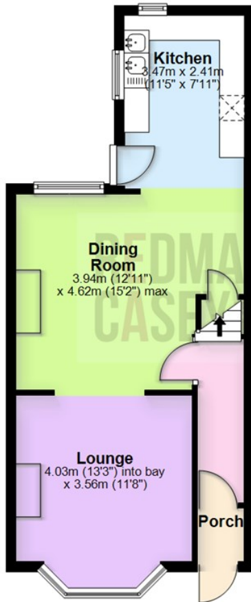
Ground Floor Approx. 42.9 sq. metres (462.0 sq. feet)